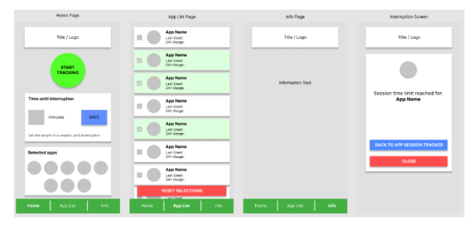
Fig. 1. User Interface designs

User interface (UI) mock-ups were designed in accordance with Nielsen's usability heuristics [26]. Sample UI designs are displayed in Figure 1.