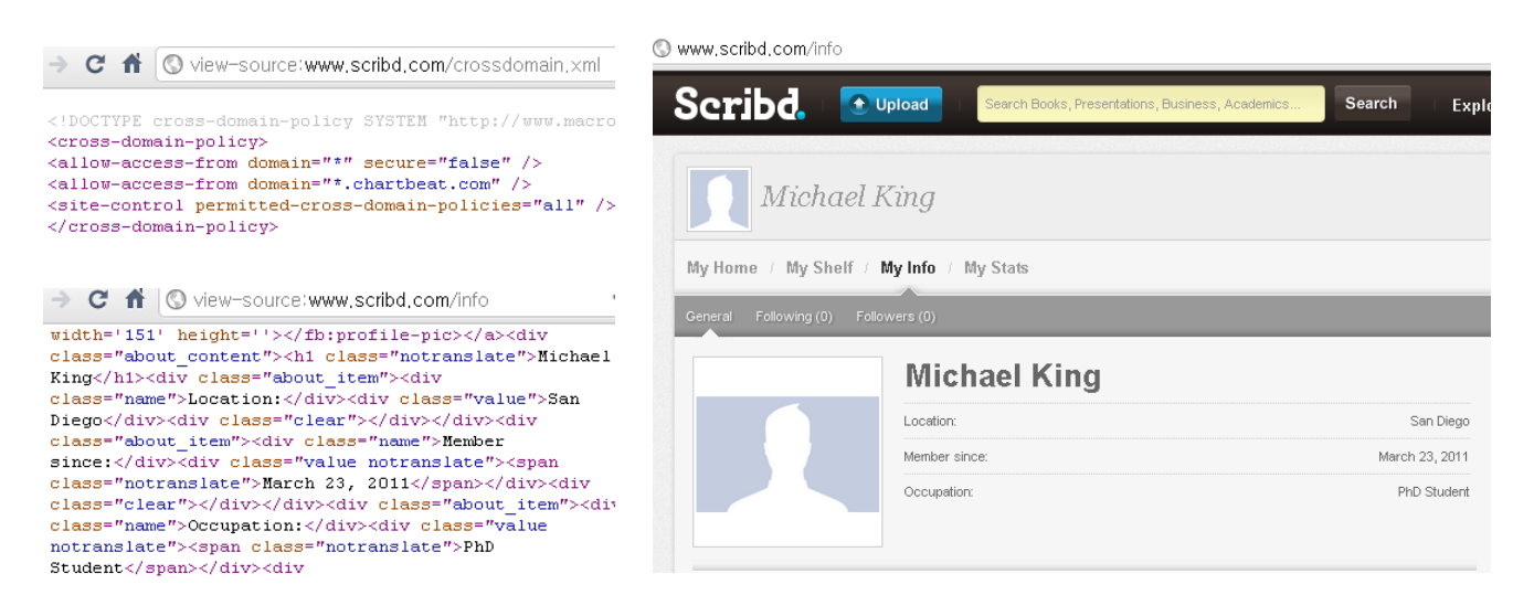
Figure 4. Crossdomain policy on www.scribd.com (Upper left), the content of a user's information page (Lower left), and the screenshot of the page (Right).

each Alexa entry "example.com" we queried the server "http://example.com:80/". An equally valid choice for host, "www.example.com", might give different results, but we do not have data to compare. This is a limitation of our survey. Our crawler did follow any HTTP redirects from example.com to www.example.com, however. Considering "www.example.com" would not have helped if a site's important content is hosted on another subdomain, e.g., "cdn.example.com". We did not attempt to make HTTPS connections in addition to HTTP connections. Nor did we attempt to gather sub-path policy files in addition to the rootlevel policy file.