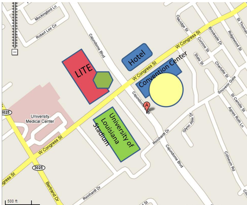
MAP 1: IEEE VR Location

New this year → Exhibit Hall A is a standard convention center exhibit area, with the high ceilings usually found on Exhibit Halls at large Convention Centers.